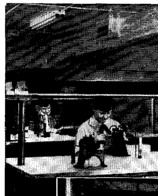
Assembling Electronic Parts

... for your process or the testing or protection of your products and materials... with EXACT moisture control at all times of the year